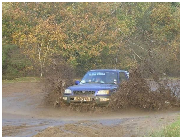
A Wild Rhino in the mud

A new site to the club, this site is located just outside of Petersfield at the back of the queen Elizabeth country park and is very large, relatively little 4x4 usage as well, aiming to have either a punch card or trial day running alongside the play day.