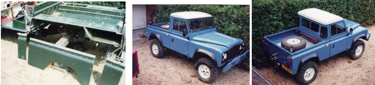
4. The rear body panels were cut to keep the wheel arch in the right place. 5. The vehicle when first completed. 6. The rear view.

After many greenlaning trips and battle scars, it was hand painted nato green and later matt black.