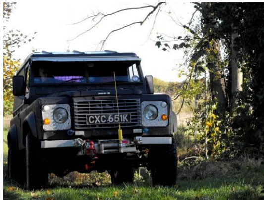
10. As it is now 21 years later.

In 2008, CXC 651 K was modified to become a marshal vehicle by adding a winch and fitting out with full recovery gear, adding 240V electrics to run cutting tools and fitted out with tool boxes first aid and fire equipment.