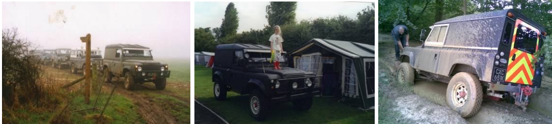
7. With the hard top fitted and in nato green 8. Later was changed to matt black. On holiday with my Daughter when she was 5 years old. She is now 21. 9. Stuck greenlaning. Yes it does happen to me.

In 2008, CXC 651 K was modified to become a marshal vehicle by adding a winch and fitting out with full recovery gear, adding 240V electrics to run cutting tools and fitted out with tool boxes first aid and fire equipment.