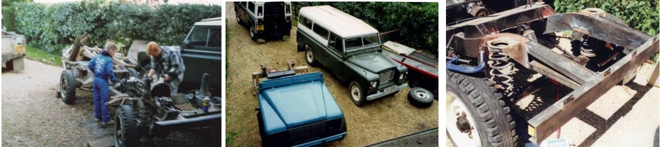
1, The chassis after range rover body was removed 2, The bonnet and radiator panel are a fibre glass kit to make a series 3 look like a defender. 3. The rear of chassis was chopped and modified to make a stronger rear crossmember.

Range rover, year of manufacture 1970, chassis number 35600098A